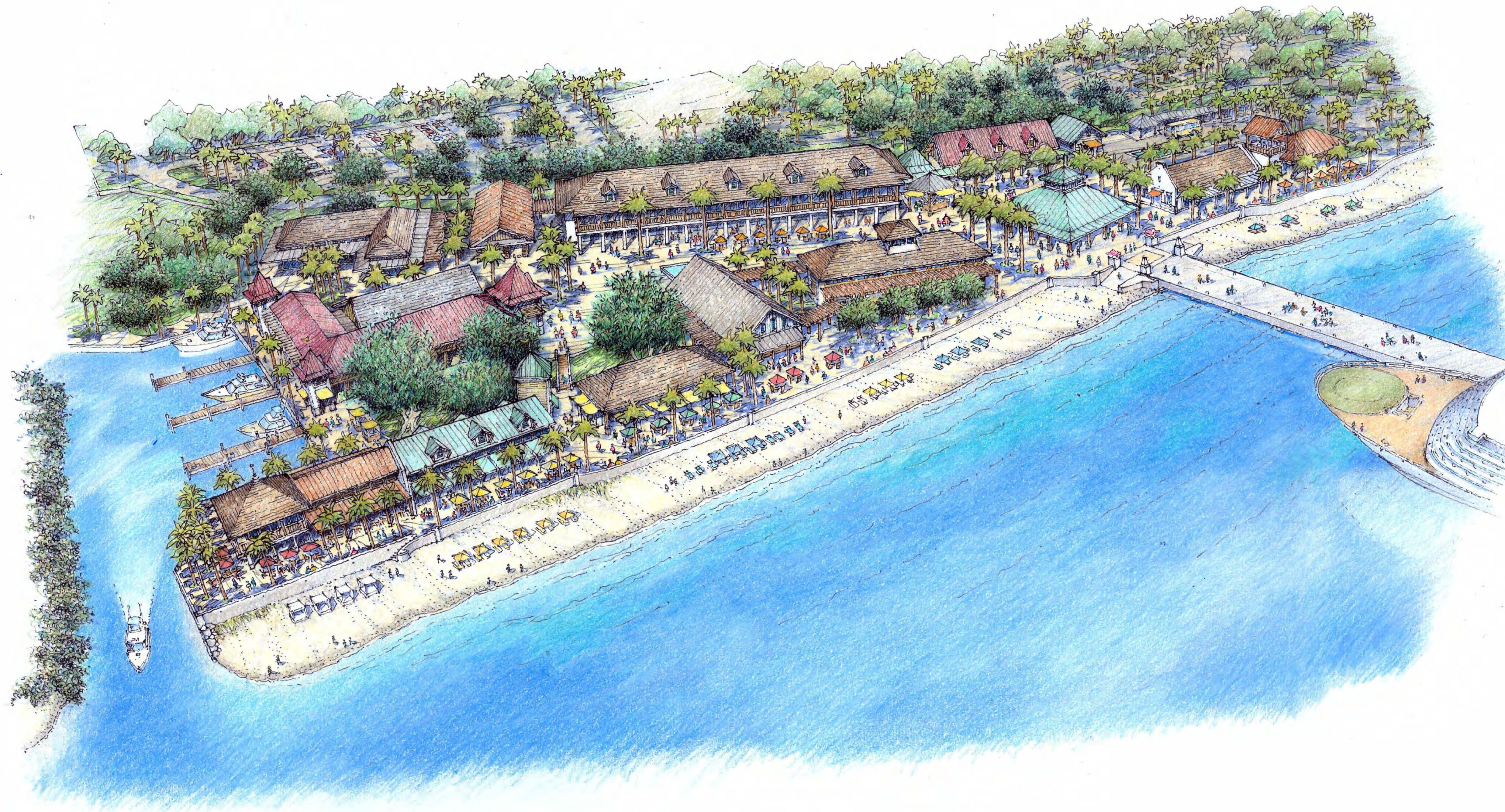
B-1 AERIAL PERSPECTIVE